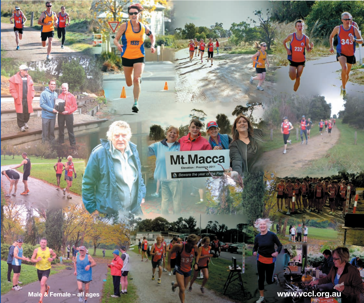
Male & Female – all ages